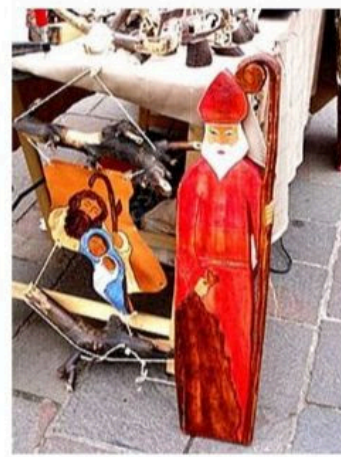
A depiction of Saint Nicholas with his sack standing next to a Nativity Scene .

Our Saviour's Lutheran Church 10 Farrand St.