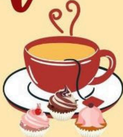
Tea and bake table

Saturday October 26 1:00pm - 3:30pm Adults $8 Children 12 and under $5