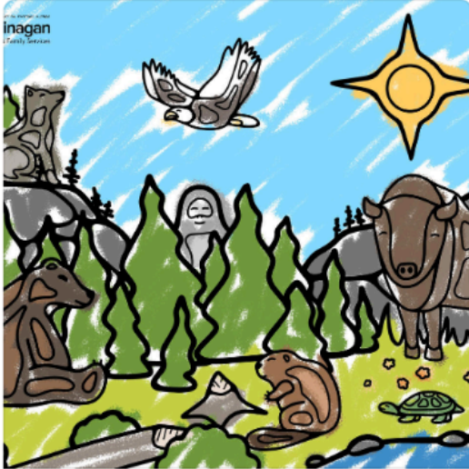
HOC Activity Book

https://www.tikinagan.org/.../2024/07/HOC_colouringbook.pdf