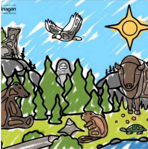
HOC Activity Book

https://www.tikinagan.org/.../2024/07/HOC_colouringbook.pdf